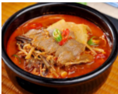
Yuk Gae Jang