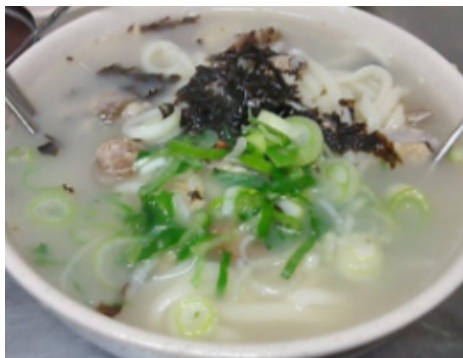
Korean Noodle Soup