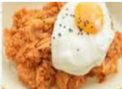
Kimchi Fried Rice