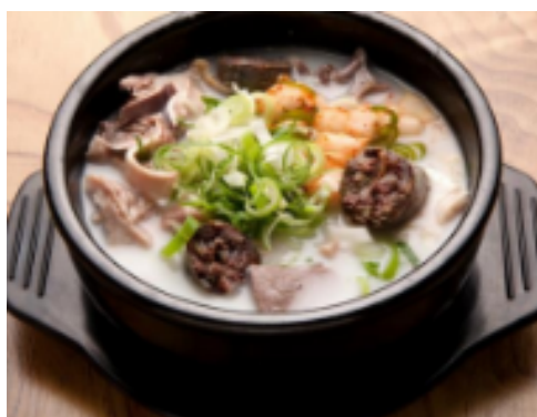
Soon Dae Guk