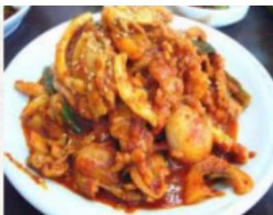
Spicy Pork & Calamari