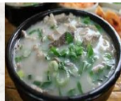
Pork Head Soup