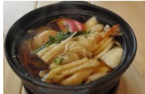
Shrimp Tempura Udon Soup