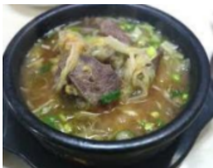
Galbi Hae Jang Guk