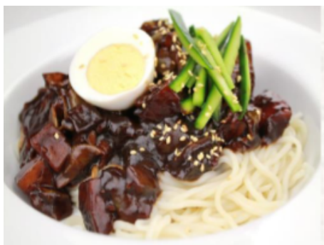
Black Bean Noodles