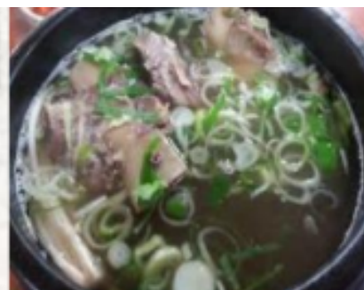
Beef Rib Soup