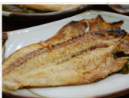
Pan Fried Mackerel