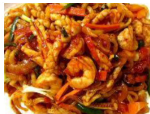
Sauteed Seafood Udon